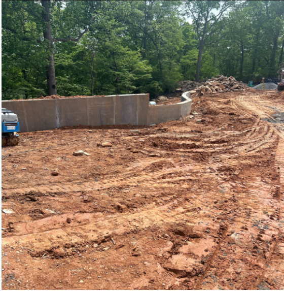
Backfill at the retaining wall is complete