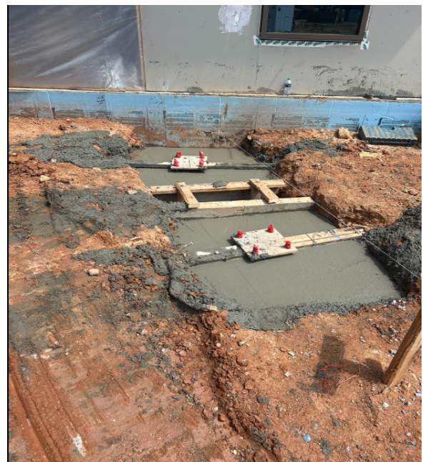
Complete column footing pour back for security vestibule