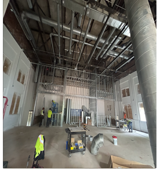
Continue installing all HVAC duct and continue metal stud framing