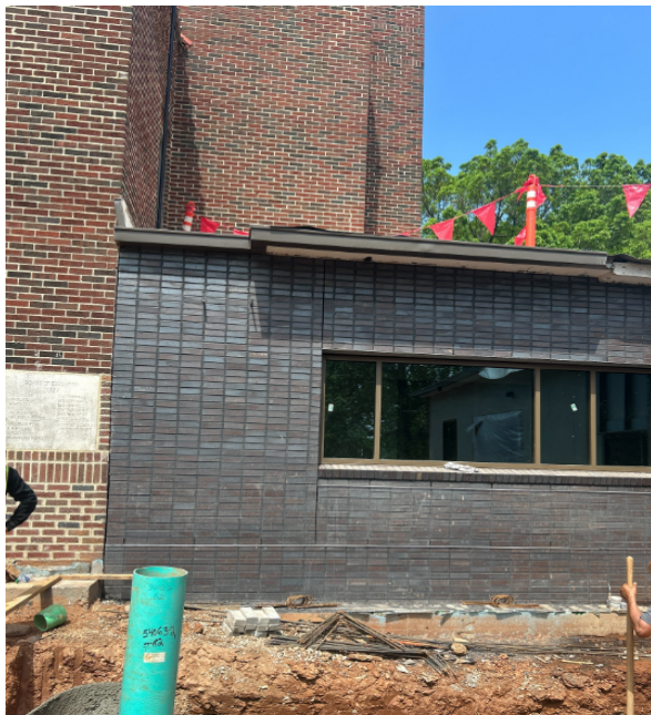
Continue with storefront glass install